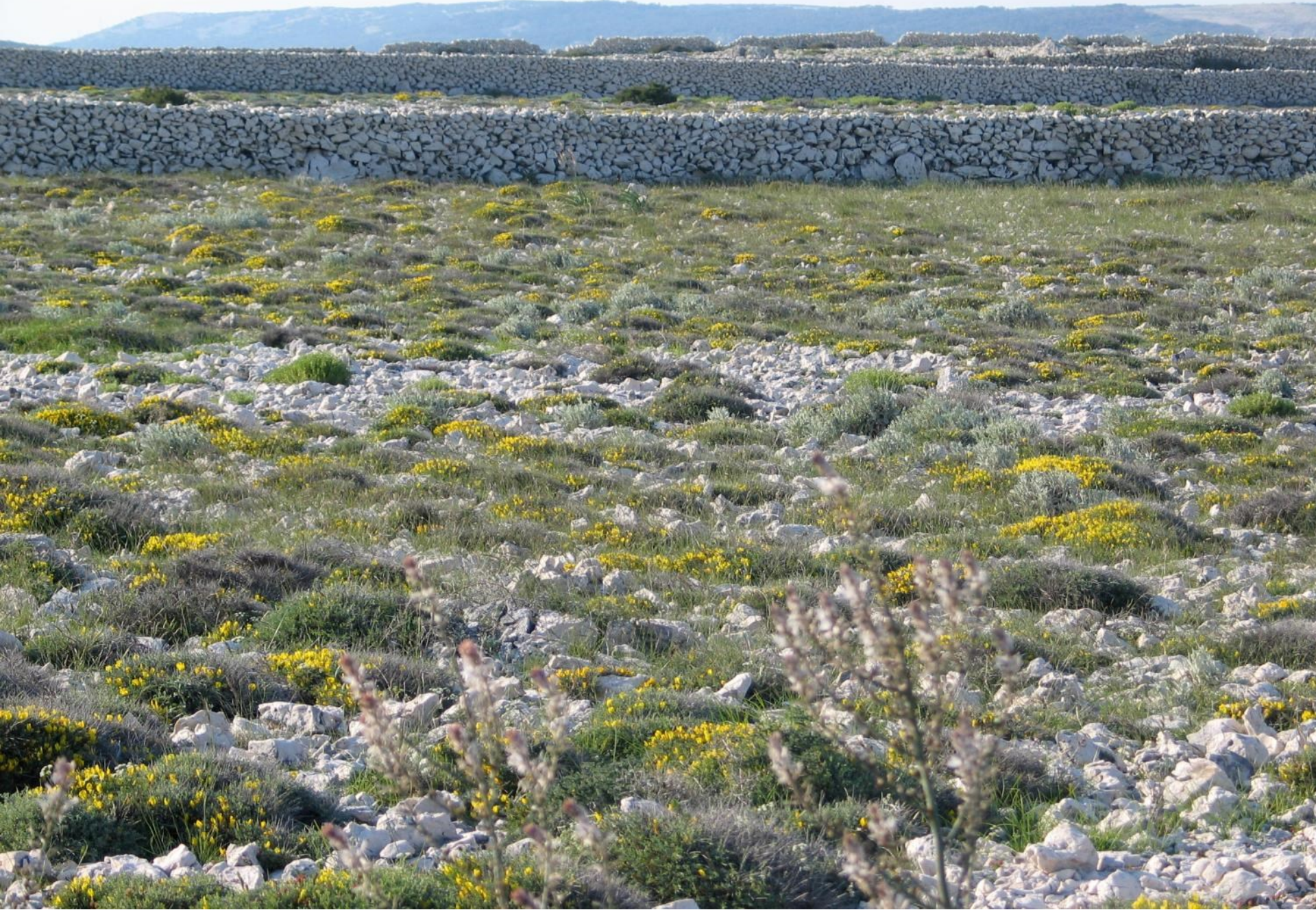
Island of Pag – good practice and economic prosperity