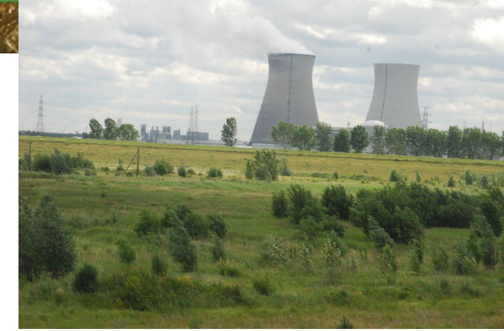
Groot Saefthinge cross-border park

Kalmthoutse Heide – De Zoom cross-border park