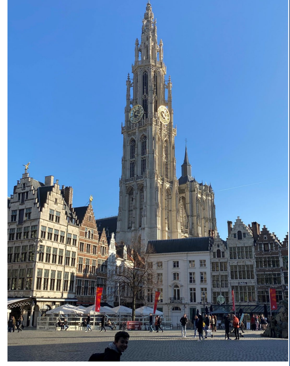
3<sup>rd</sup> Natura 2000 Atlantic Seminar