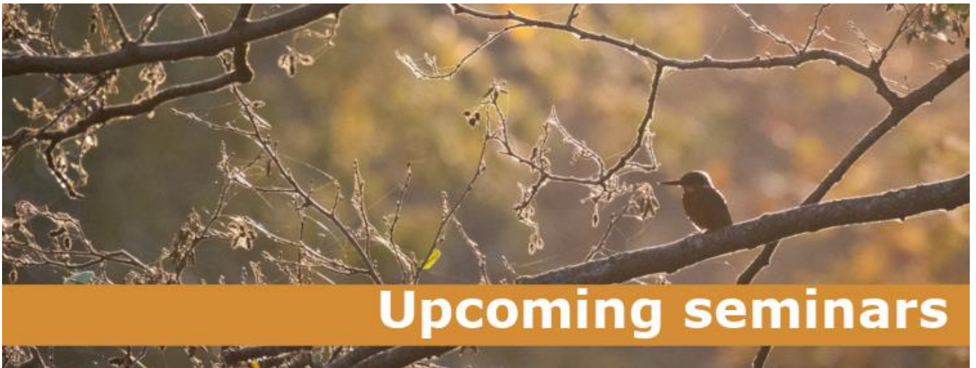
Photo: Kingfisher, Alcedo atthis.

Preparations for the upcoming terrestrial Mediterranean and Continental, as well as marine Mediterranean and Black Sea biogeographic seminars are ongoing. The 2024 seminars will focus on reviewing and exchanging on the pledges that countries submit for the targets on protected areas and status improvement of species and habitats in the EU Biodiversity Strategy for 2030.