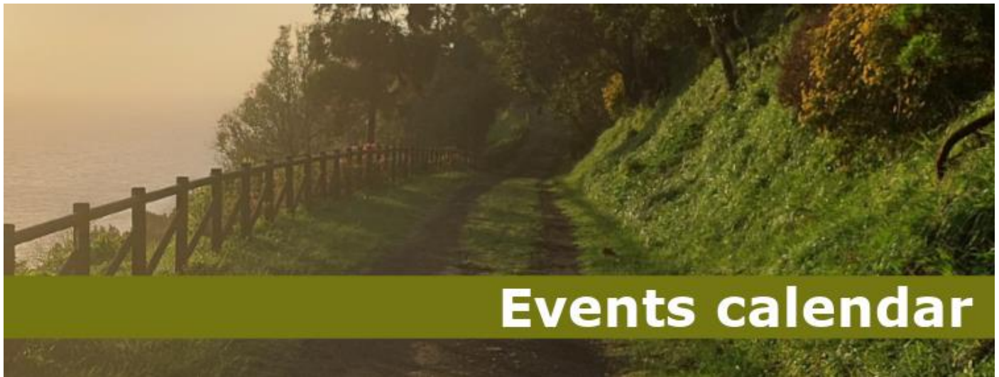
Photo: Macaronesian landscape.