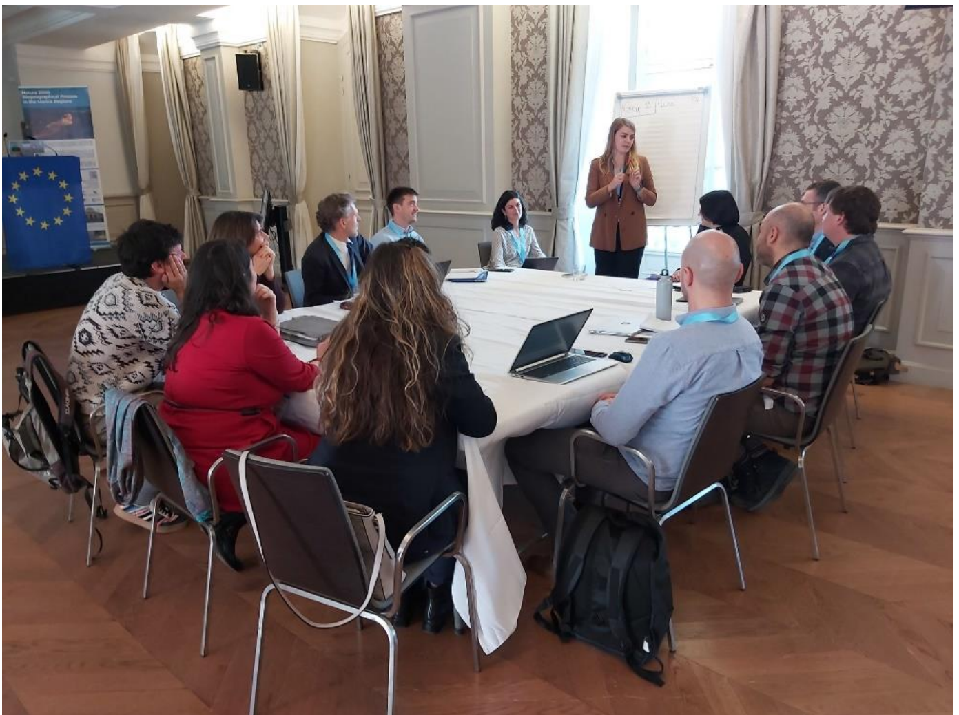
Photo: A seminar working group discusses pledges.

The first part of the day consisted of presentations on Protected Areas targets, whilst the afternoon session focused on Conservation Status targets – with several Member States presenting their progress towards targets and challenges faced along the way. Each of these sessions was followed by group discussions, where participants identified the main challenges of making pledges and suggested solutions for those challenges.