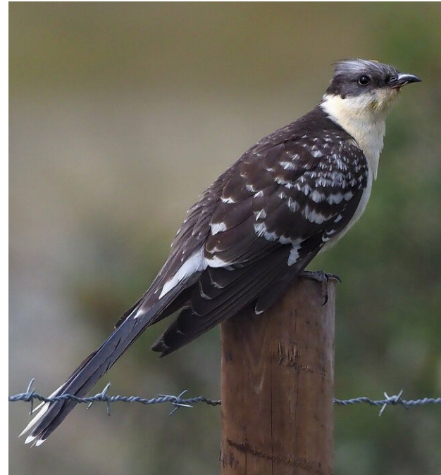
Clamator glandarius