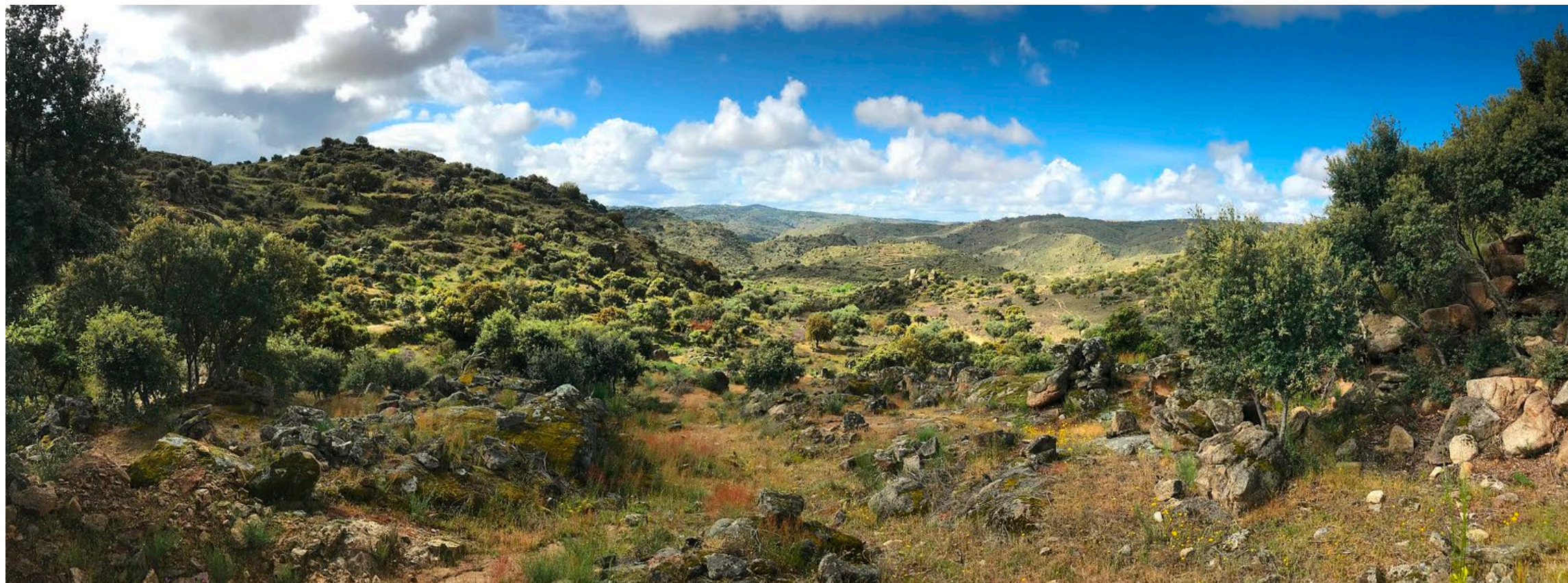
Área Protegida Privada da Faia Brava, Vale do Côa, Portugal