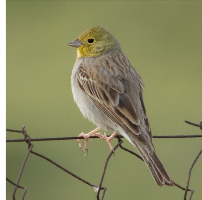
Emberiza cineracea (Frank Vassen)